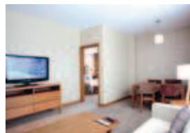
Suite An elegant and refined suite offering exclusive services.